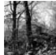
European forest, Spain