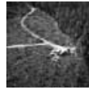
Clearcut, Karelia, Russia

FERN works with Russian NGOs on illegal logging issues and with Friends of Siberian Forests on international issues.