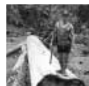
Logging in Sarawak

IDEAL is one of the organisations FERN is working with in Malaysia on indigenous rights and forest certification.