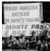
Pataxó reserve, Brazil