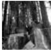
Old-growth logging in California, USA

FERN works with different NGOs in the USA on a range of issues. On certification with NRDC and American Lands, on ECAs with Pacific Environment, Environmental Defense and to a lesser extent with CIEL, WRI and FoE USA.